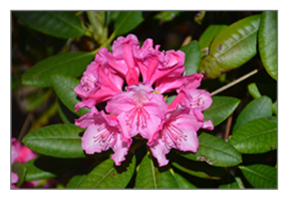
Haaga Rhododendron flowers

A relatively new broadleaf evergreen shrub with rich deep pink flowers in spring, coarse dark foliage and an upright mounded habit, quite hardy; absolutely must have well-drained, highly acidic and organic soil, use plenty of peat moss when planting