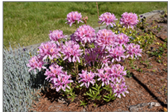
Orchid Lights Azalea in bloom