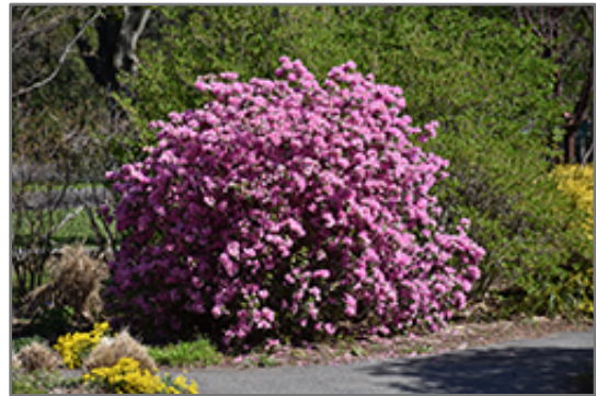
P.J.M. Elite Rhododendron in bloom