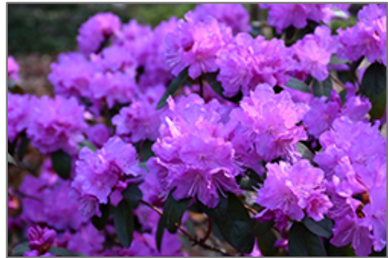
P.J.M. Elite Rhododendron flowers

P.J.M. Elite Rhododendron is recommended for the following landscape applications;