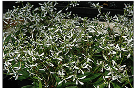
Silver Fog Euphorbia flowers