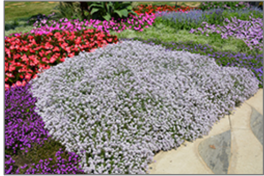
Blushing Princess Sweet Alyssum in bloom

Blushing Princess Sweet Alyssum is a fine choice for the garden, but it is also a good selection for planting in hanging baskets. Because of its trailing habit of growth, it is ideally suited for use as a 'spiller' in the 'spiller-thriller-filler' container combination; plant it near the edges where it can spill gracefully over the pot. Note that when growing plants in outdoor containers and baskets, they may require more frequent waterings than they would in the yard or garden.