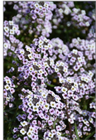
Blushing Princess Sweet Alyssum flowers

This plant will require occasional maintenance and upkeep, and should not require much pruning, except when necessary, such as to remove dieback. It is a good choice for attracting bees and butterflies to your yard, but is not particularly attractive to deer who tend to leave it alone in favor of tastier treats. It has no significant negative characteristics.