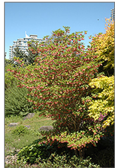
Redvein Enkianthus in bloom