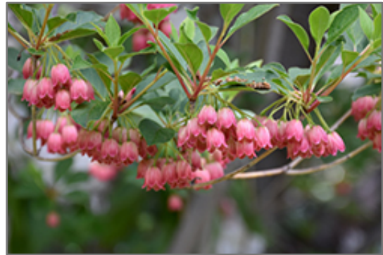
Redvein Enkianthus flowers