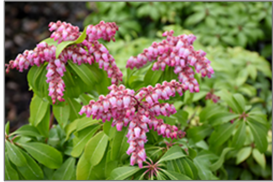
Shojo Japanese Pieris flowers

Shojo Japanese Pieris is recommended for the following landscape applications;