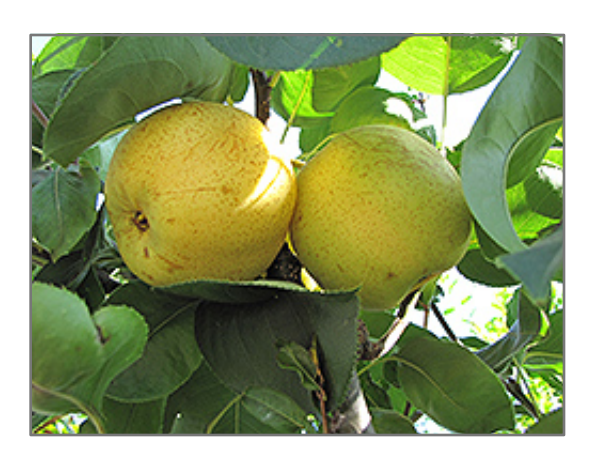
Shinseiki Asian Pear fruit

Shinseiki Asian Pear is clothed in stunning clusters of white flowers with pink anthers along the branches in early spring before the leaves. It has dark green deciduous foliage. The glossy pointy leaves turn an outstanding tomato-orange in the fall. The fruits are showy yellow pears carried in abundance in late summer. The fruit can be messy if allowed to drop on the lawn or walkways, and may require occasional clean-up.