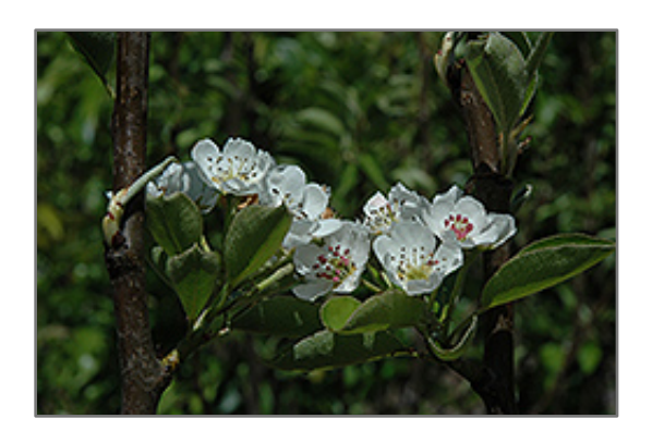
Shinseiki Asian Pear flowers