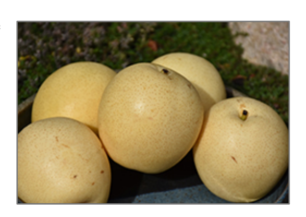
Shinseiki Asian Pear fruit

This tree is typically grown in a designated area of the yard because of its mature size and spread. It should only be grown in full sunlight. It does best in average to evenly moist conditions, but will not tolerate standing water. It is not particular as to soil type or pH. It is highly tolerant of urban pollution and will even thrive in inner city environments. This is a selected variety of a species not originally from North America.