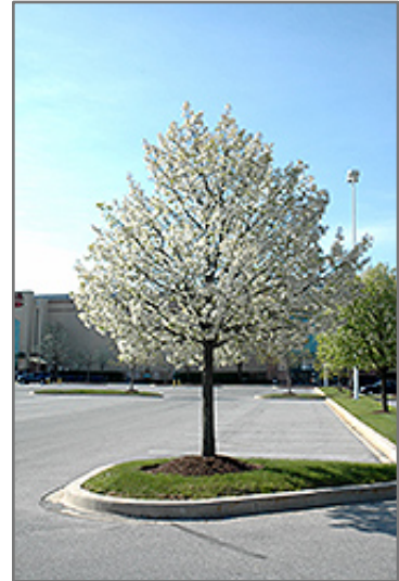
Jack Ornamental Pear in bloom