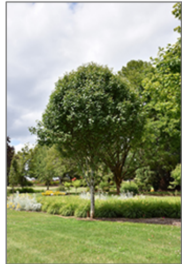
Jack Ornamental Pear

This tree should only be grown in full sunlight. It prefers to grow in average to moist conditions, and shouldn't be allowed to dry out. It is not particular as to soil type or pH. It is highly tolerant of urban pollution and will even thrive in inner city environments. This is a selected variety of a species not originally from North America.