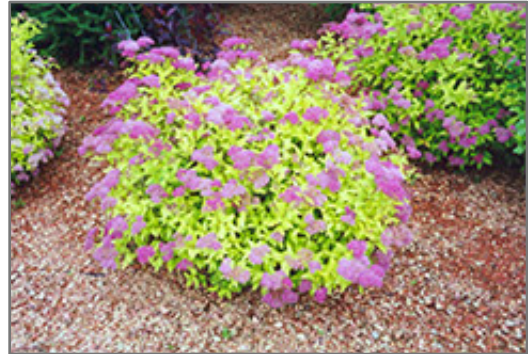
Goldmound Spirea in bloom

This shrub should only be grown in full sunlight. It prefers to grow in average to moist conditions, and shouldn't be allowed to dry out. It is not particular as to soil type or pH. It is highly tolerant of urban pollution and will even thrive in inner city environments. This is a selected variety of a species not originally from North America.