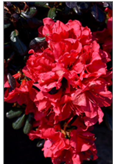
Johanna Azalea flowers