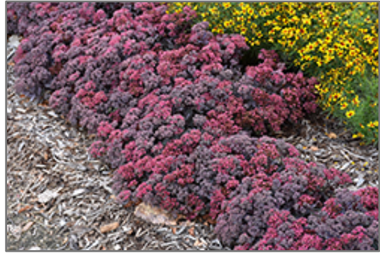
Dazzleberry Stonecrop in bloom

Dazzleberry Stonecrop is a fine choice for the garden, but it is also a good selection for planting in outdoor pots and containers. It is often used as a 'filler' in the 'spiller-thriller-filler' container combination, providing a mass of flowers and foliage against which the larger thriller plants stand out. Note that when growing plants in outdoor containers and baskets, they may require more frequent waterings than they would in the yard or garden.