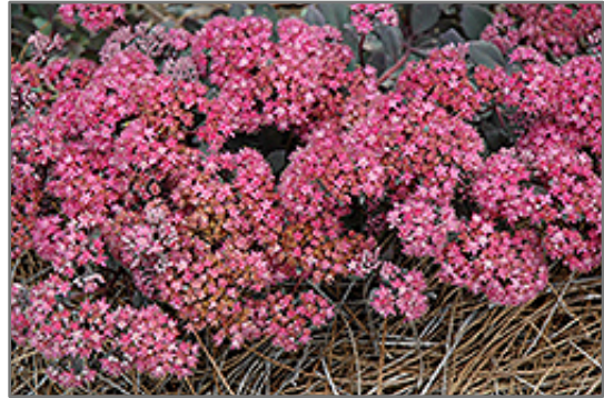
Dazzleberry Stonecrop flowers

Dazzleberry Stonecrop is a dense herbaceous perennial with an upright spreading habit of growth. Its medium texture blends into the garden, but can always be balanced by a couple of finer or coarser plants for an effective composition.