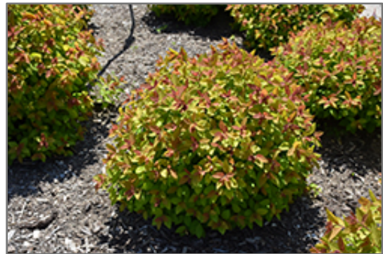
Double Play Big Bang Spirea