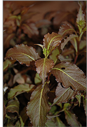
Spilled Wine Weigela foliage

Spilled Wine Weigela makes a fine choice for the outdoor landscape, but it is also well-suited for use in outdoor pots and containers. Because of its height, it is often used as a 'thriller' in the 'spiller-thriller-filler' container combination; plant it near the center of the pot, surrounded by smaller plants and those that spill over the edges. It is even sizeable enough that it can be grown alone in a suitable container. Note that when grown in a container, it may not perform exactly as indicated on the tag - this is to be expected. Also note that when growing plants in outdoor containers and baskets, they may require more frequent waterings than they would in the yard or garden.