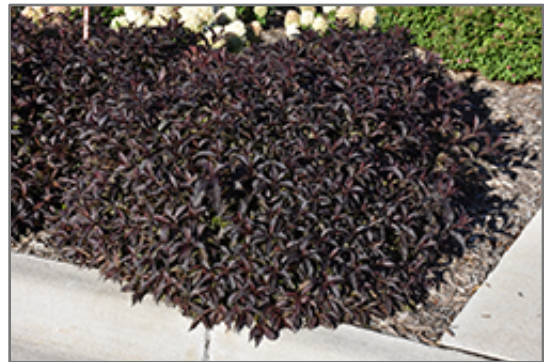
Spilled Wine Weigela