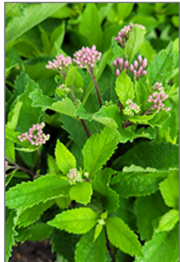
Phantom Joe Pye Weed flower buds