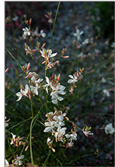
Ballerina White Gaura flowers

Ballerina White Gaura is recommended for the following landscape applications;