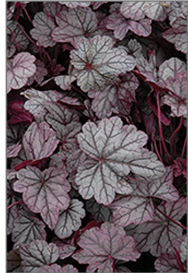
Carnival Sugar Plum Coral Bells foliage

This is a relatively low maintenance plant, and should be cut back in late fall in preparation for winter. It is a good choice for attracting hummingbirds to your yard. It has no significant negative characteristics.