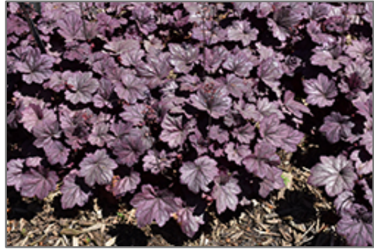
Carnival Sugar Plum Coral Bells

Carnival Sugar Plum Coral Bells is a fine choice for the garden, but it is also a good selection for planting in outdoor pots and containers. It is often used as a 'filler' in the 'spiller-thriller-filler' container combination, providing a canvas of foliage against which the larger thriller plants stand out. Note that when growing plants in outdoor containers and baskets, they may require more frequent waterings than they would in the yard or garden.