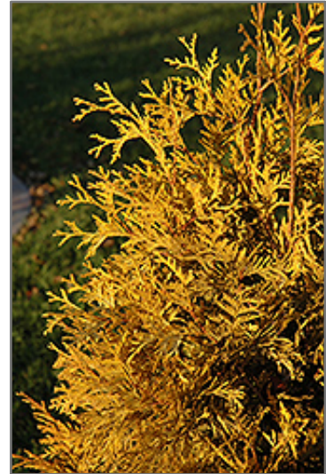
Yellow Ribbon Arborvitae in fall

This shrub does best in full sun to partial shade. It prefers to grow in average to moist conditions, and shouldn't be allowed to dry out. It is not particular as to soil type or pH. It is somewhat tolerant of urban pollution, and will benefit from being planted in a relatively sheltered location. Consider applying a thick mulch around the root zone in winter to protect it in exposed locations or colder microclimates. This is a selection of a native North American species.