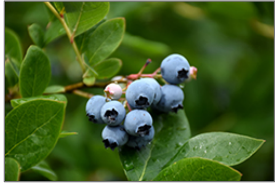
Northcountry Blueberry fruit

Northcountry Blueberry features dainty clusters of white bell-shaped flowers with shell pink overtones hanging below the branches in mid spring. It has green deciduous foliage. The glossy oval leaves turn an outstanding scarlet in the fall. It features an abundance of magnificent blue berries in mid summer.