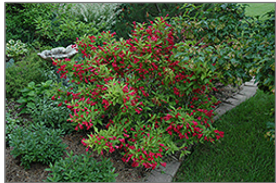
Red Prince Weigela in bloom