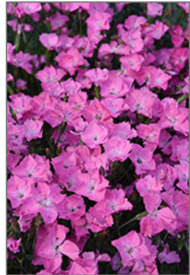
Beauties Kahori Pink Pinks flowers

Beauties Kahori Pink Pinks is recommended for the following landscape applications;