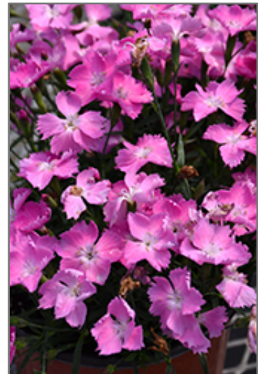
Beauties Kahori Pink Pinks flowers