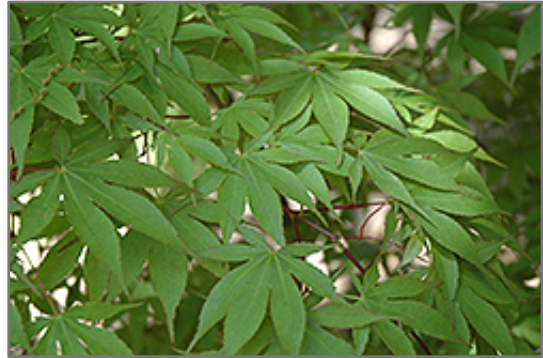
Osakazuki Japanese Maple foliage

This is a relatively low maintenance tree, and should only be pruned in summer after the leaves have fully developed, as it may 'bleed' sap if pruned in late winter or early spring. It has no significant negative characteristics.