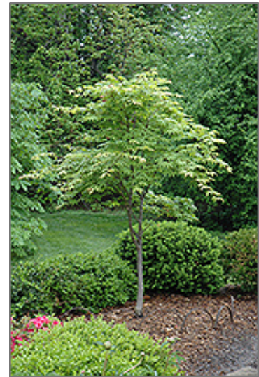
Osakazuki Japanese Maple