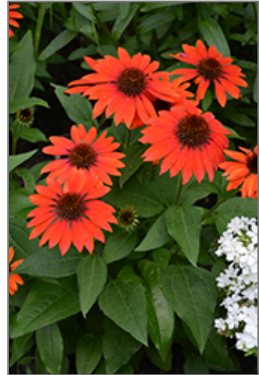
Sombrero Flamenco Orange Coneflower in bloom

Sombrero Flamenco Orange Coneflower is recommended for the following landscape applications;