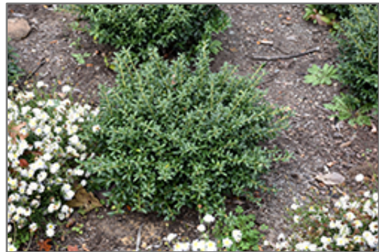
Soft Touch Japanese Holly