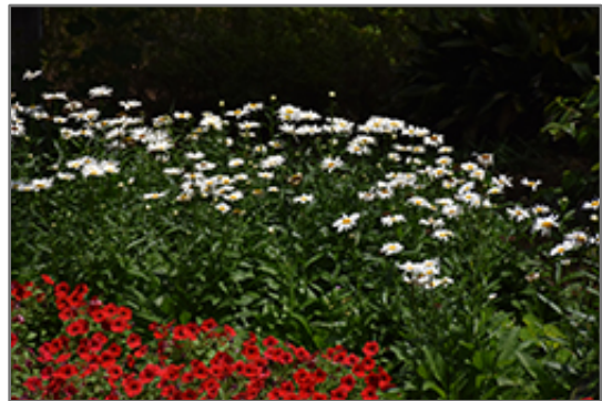
Brightside Shasta Daisy in bloom