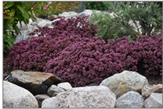
Cherry Tart Stonecrop in bloom

Cherry Tart Stonecrop is a dense herbaceous perennial with an upright spreading habit of growth. Its medium texture blends into the garden, but can always be balanced by a couple of finer or coarser plants for an effective composition.