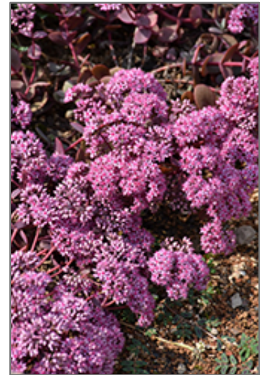
Cherry Tart Stonecrop flowers

Cherry Tart Stonecrop is a fine choice for the garden, but it is also a good selection for planting in outdoor pots and containers. It is often used as a 'filler' in the 'spiller-thriller-filler' container combination, providing a mass of flowers and foliage against which the larger thriller plants stand out. Note that when growing plants in outdoor containers and baskets, they may require more frequent waterings than they would in the yard or garden.