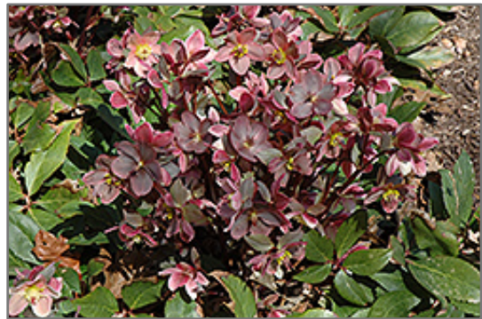
Pink Frost Hellebore in bloom