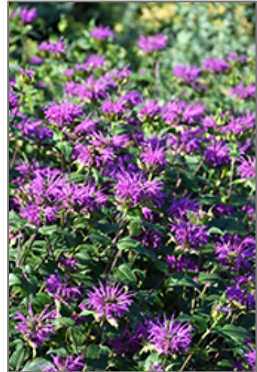
Dark Ponticum Beebalm flowers