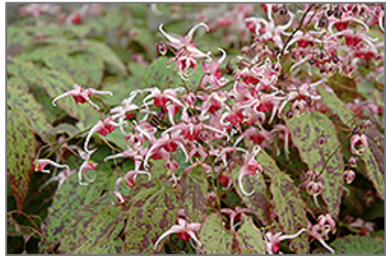
Pink Champagne Fairy Wings flowers