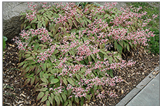
Pink Champagne Fairy Wings in bloom