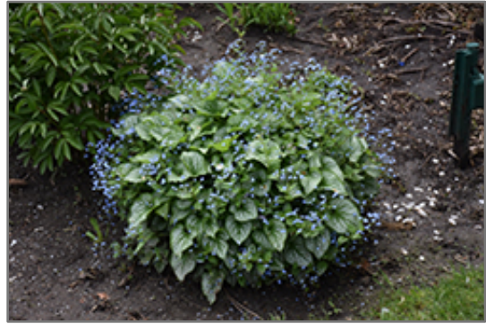
Sea Heart Bugloss in bloom

Sea Heart Bugloss will grow to be about 12 inches tall at maturity extending to 16 inches tall with the flowers, with a spread of 18 inches. When grown in masses or used as a bedding plant, individual plants should be spaced approximately 14 inches apart. It grows at a medium rate, and under ideal conditions can be expected to live for approximately 10 years. As an herbaceous perennial, this plant will usually die back to the crown each winter, and will regrow from the base each spring. Be careful not to disturb the crown in late winter when it may not be readily seen!