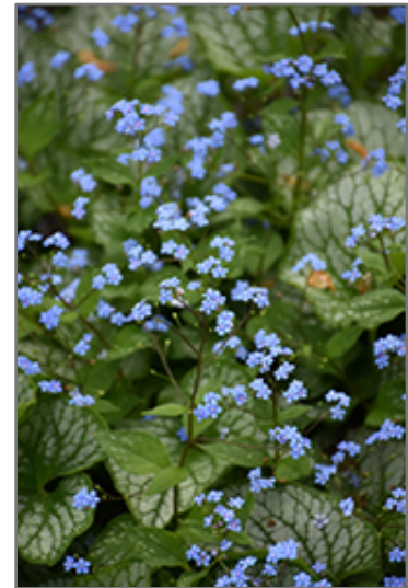
Sea Heart Bugloss flowers

Sea Heart Bugloss is recommended for the following landscape applications;