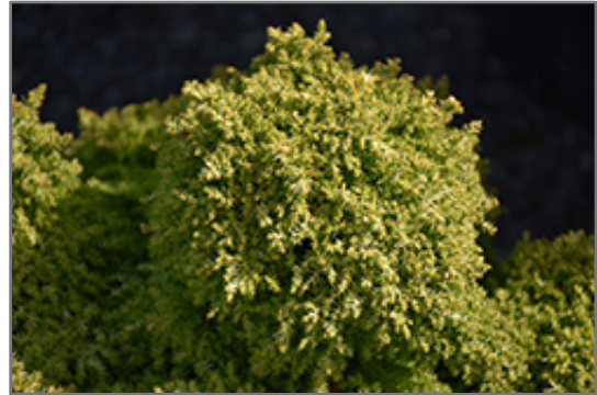
Twinkle Toes Japanese Cedar foliage