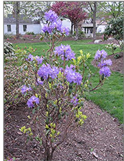
Blue Baron Rhododendron in bloom

This shrub does best in full sun to partial shade. You may want to keep it away from hot, dry locations that receive direct afternoon sun or which get reflected sunlight, such as against the south side of a white wall. It requires an evenly moist well-drained soil for optimal growth, but will die in standing water. It is very fussy about its soil conditions and must have rich, acidic soils to ensure success, and is subject to chlorosis (yellowing) of the foliage in alkaline soils. It is somewhat tolerant of urban pollution, and will benefit from being planted in a relatively sheltered location. Consider applying a thick mulch around the root zone in winter to protect it in exposed locations or colder microclimates. This particular variety is an interspecific hybrid.