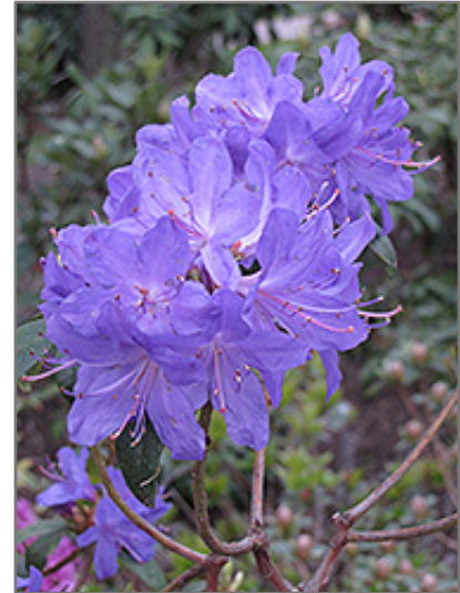
Blue Baron Rhododendron flowers