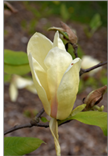
Yellow Lantern Magnolia flowers