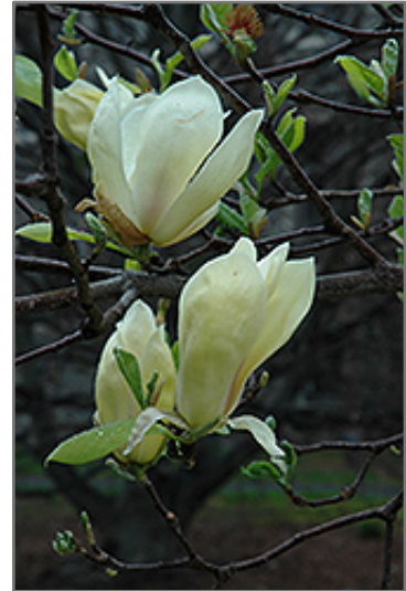
Yellow Lantern Magnolia flowers

This tree does best in full sun to partial shade. It requires an evenly moist well-drained soil for optimal growth, but will die in standing water. It is not particular as to soil type, but has a definite preference for acidic soils. It is quite intolerant of urban pollution, therefore inner city or urban streetside plantings are best avoided. Consider applying a thick mulch around the root zone in winter to protect it in exposed locations or colder microclimates. This particular variety is an interspecific hybrid.