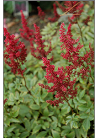
August Light Astilbe flowers