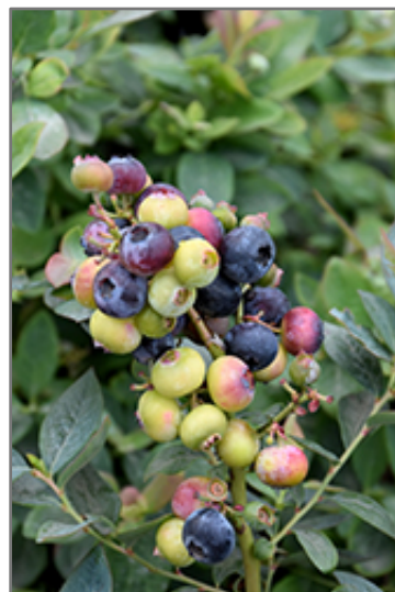
Pink Icing Blueberry fruit

This is a multi-stemmed deciduous shrub with an upright spreading habit of growth. Its relatively fine texture sets it apart from other landscape plants with less refined foliage. This is a relatively low maintenance plant, and usually looks its best without pruning, although it will tolerate pruning. It is a good choice for attracting birds to your yard. It has no significant negative characteristics.