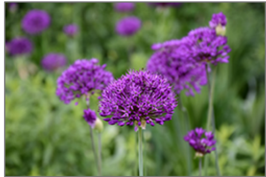
Purple Sensation Ornamental Onion flowers

This is a relatively low maintenance plant, and should only be pruned after flowering to avoid removing any of the current season's flowers. It is a good choice for attracting butterflies to your yard, but is not particularly attractive to deer who tend to leave it alone in favor of tastier treats. It has no significant negative characteristics.