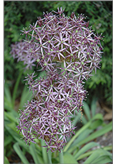
Star Of Persia Onion flowers