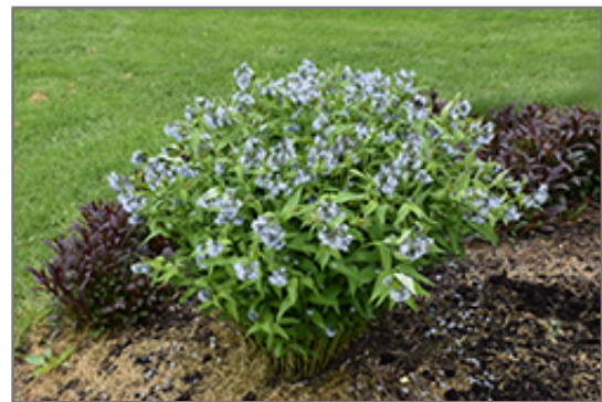
Blue Star Flower in bloom