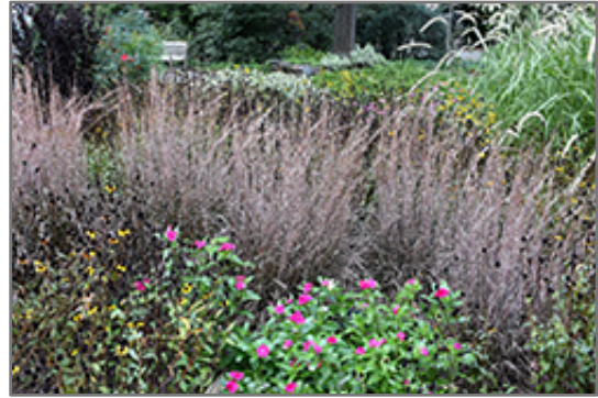
Standing Ovation Bluestem in fall

Standing Ovation Bluestem is recommended for the following landscape applications;