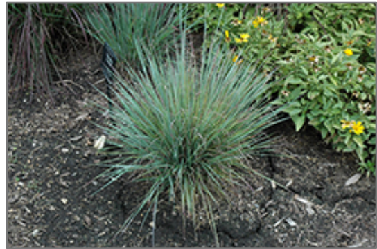
Standing Ovation Bluestem