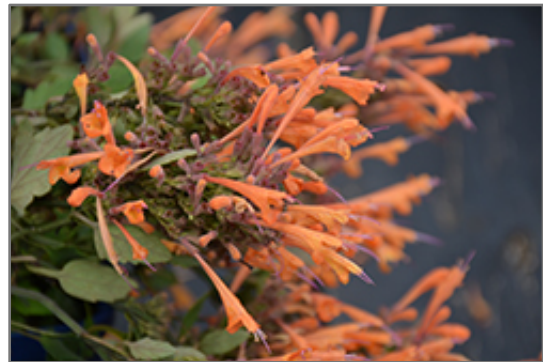
Kudos Mandarin Hyssop flowers