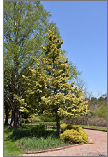
Cripps Gold Falsecypress

This tree does best in full sun to partial shade. It prefers to grow in average to moist conditions, and shouldn't be allowed to dry out. It is not particular as to soil type or pH. It is highly tolerant of urban pollution and will even thrive in inner city environments, and will benefit from being planted in a relatively sheltered location. Consider applying a thick mulch around the root zone in winter to protect it in exposed locations or colder microclimates. This is a selected variety of a species not originally from North America.