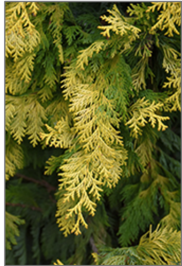
Cripps Gold Falsecypress foliage