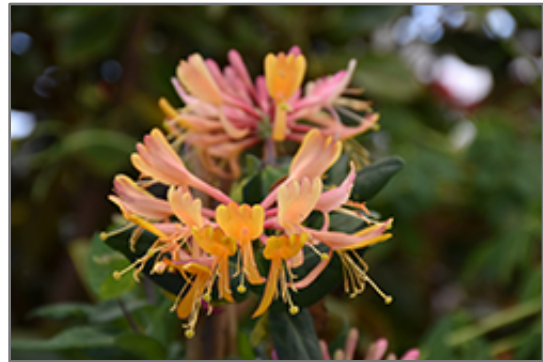
Goldflame Honeysuckle flowers