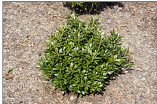
Gem Box Inkberry Holly