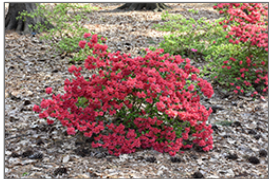
Girard's Crimson Azalea in bloom