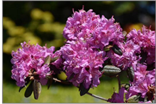
Midnight Ruby Rhododendron flowers