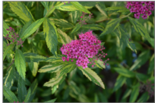
Double Play Painted Lady Spirea flowers