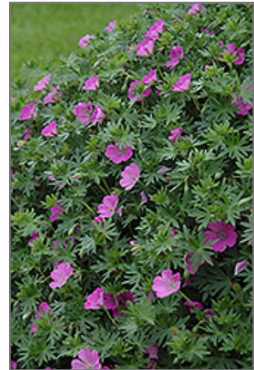
Bloody Cranesbill flowers