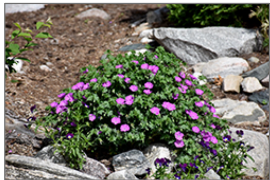
Bloody Cranesbill in bloom