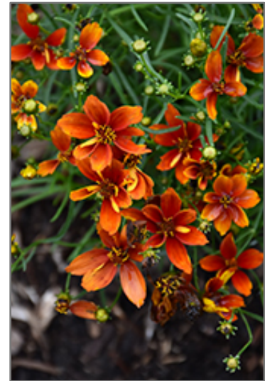
Sizzle And Spice Crazy Cayenne Tickseed flowers

Sizzle And Spice Crazy Cayenne Tickseed is recommended for the following landscape applications;