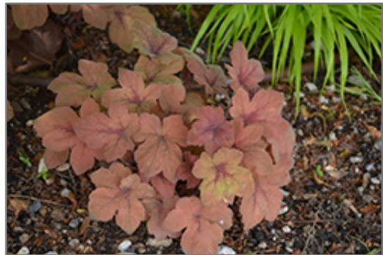
Pumpkin Spice Foamy Bells