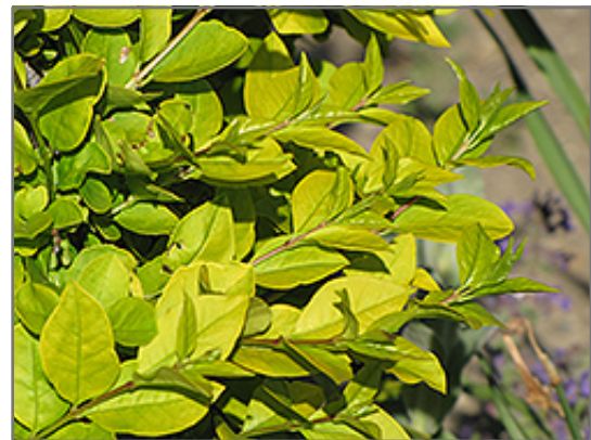
Golden Privet foliage